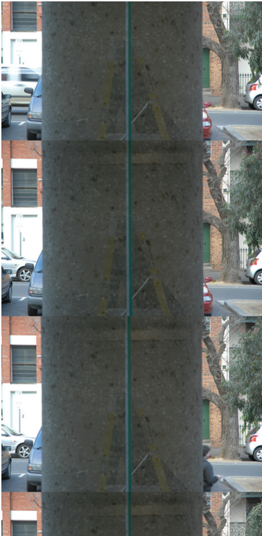
Top Right Daniel Armstrong Beyond , 2009 Video, sound, glass, photography installation Dimensions variable