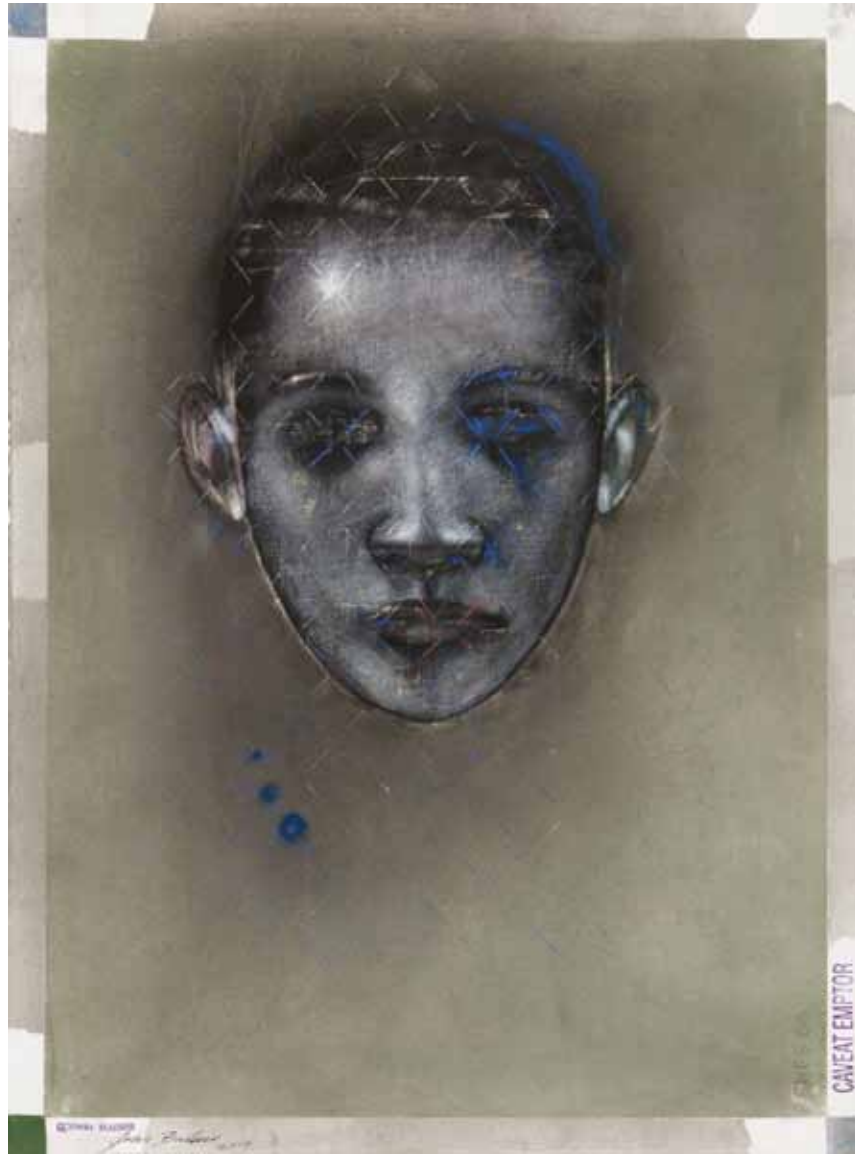
Godwin Bradbeer Cameo Cosmetica , 2009 Chinagraph, silver oxide, pastel and dust on paper 57 x 77 cm